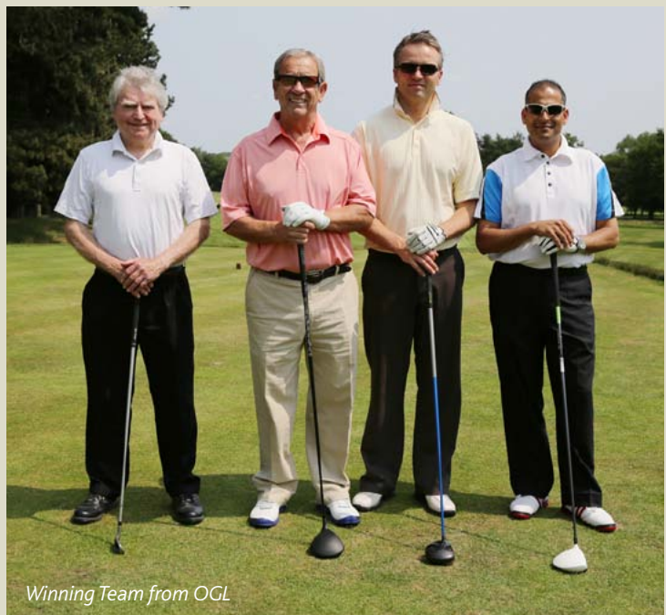
Winning Team from OGL

Wall James Chappell held their second golf day, in support of Mary Stevens Hospice, on the 5th July 2013 at Blackwell Golf Club. The day was a tremendous success and over £750 was raised for the Hospice. Over 40 players took part and the overall winner was the team from OGL Computer, who are an IT support and solutions company based in Worcestershire.